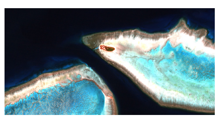
Sentinel-2 image of Heron and Wistari Reefs taken at June 24, 2017.