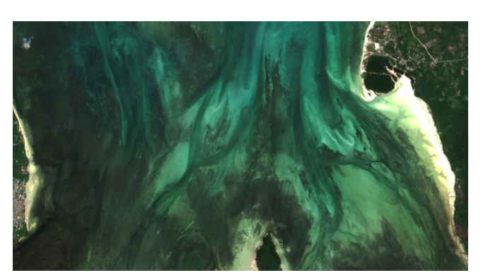
Sentinel-2 image of sea grass beds in Chakwa Bay, Tanzania, 6 June 2018.