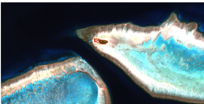
Sentinel-2 image of Heron and Wistari Reefs taken at June 24, 2017.